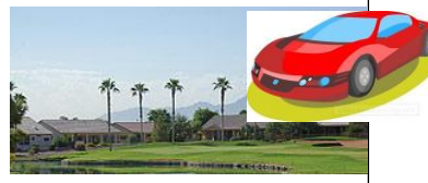
Two Money Holes